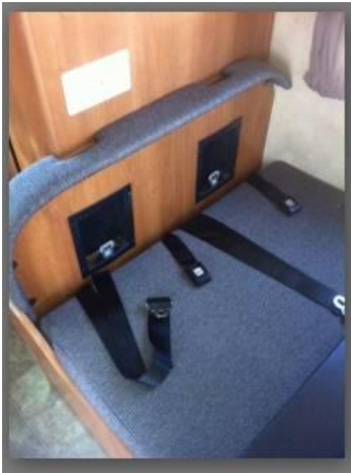
1) Dinette seat and backrest removed

The pictures below show Child Seat tethered without the seat cushion backrest. This is optional—it makes it easier to install/set-up, but leaving the backrest in place works too. There is not much difference in installing it either way.