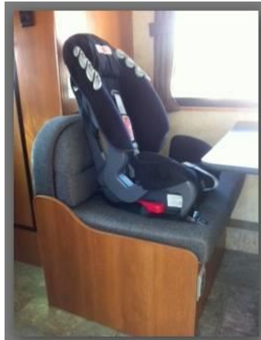
2) Child seat placed on Dinette – unattached