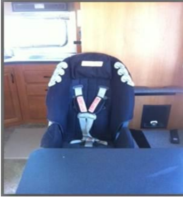
7) View of child seat from opposite side of dinette